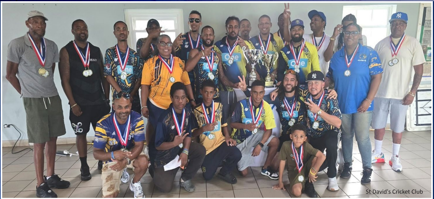
St David's Cricket Club