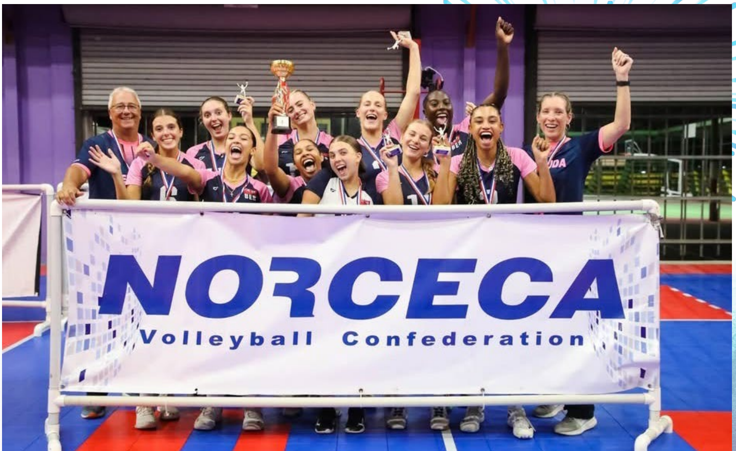
Women's NT - Silver Medal