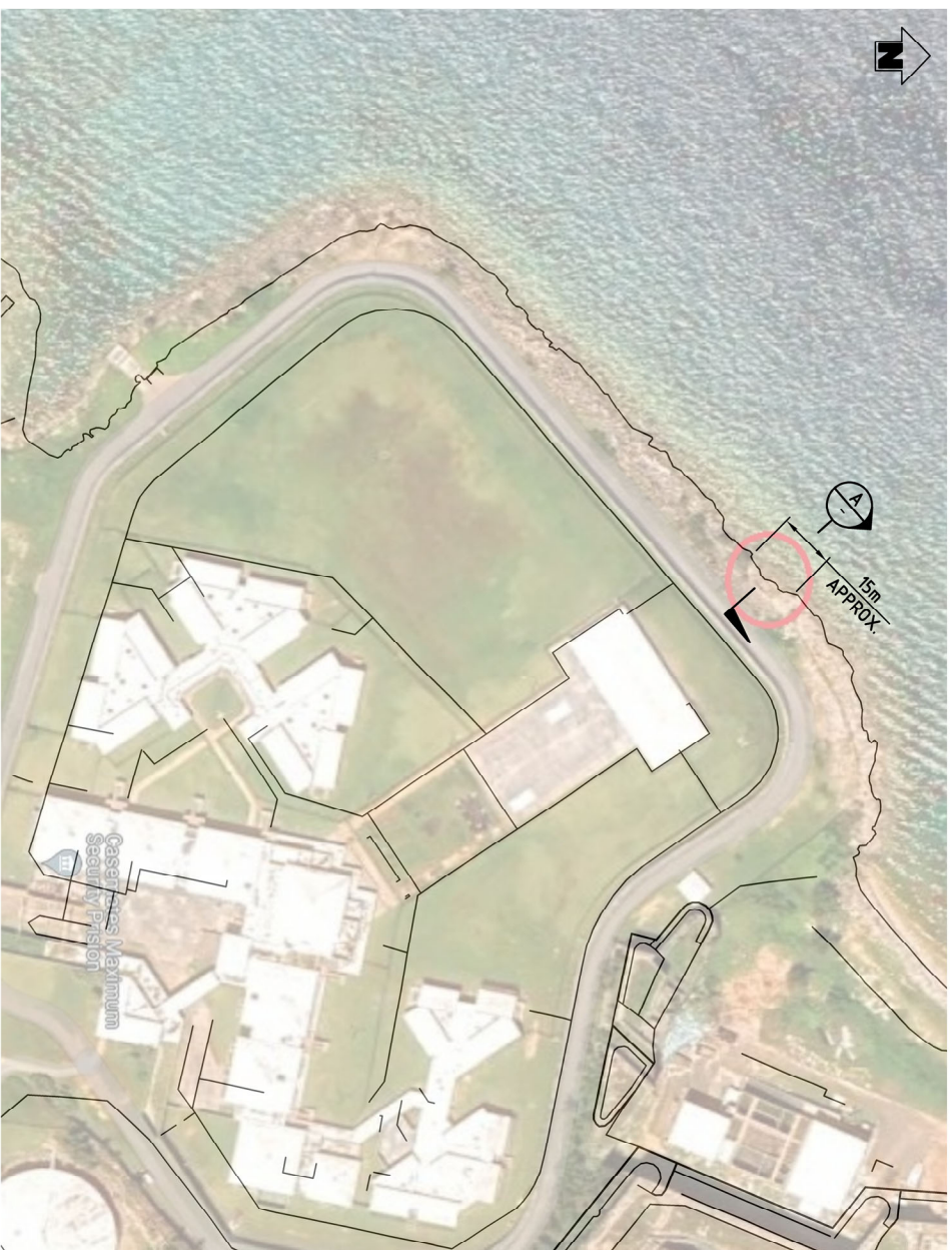
SITE PLAN 1:1000